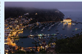
Avalon Harbor Nighttime

Catalina has been occupied for the past 7000 years, firstly by the Pimungane Native American tribe, then the Spanish Empire, then Mexico, and finally the United States of America. It went through several private ownership changes until the chewing gum entrepreneur William Wrigley Jr. purchased nearly every share of the Catalina Island Company, becoming the majority owner in 1919.