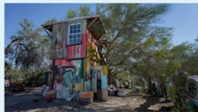
East Jesus Multi-Colored Building

Slab City is an unincorporated, off-the-grid alternative lifestyle community consisting largely of snowbirds (people who migrated from northern states during winter months) in the Salton (a rift valley) area of the Sonoran Desert, in southeastern California. Its name comes from the concrete slabs that remain after the World War II USA Marine Corps Dunlap Training Camp was torn down. Slab City is near the east shore of the Salton Sea and southeast of the Salton Sea town of Bombay Beach, an area that attracts tourists, photographers, and contemporary and abstract artists.