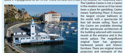
Avalon Yacht Club

Wrigley invested millions of dollars to turn Avalon into a playground for the rich and famous. He called it "A playground for all". In the 1930s, 40s and 50s it was a hot location for Hollywood stars.