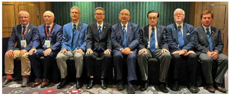
2024-2026 FIAP Directory Board