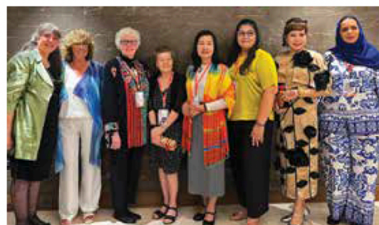
Female FIAP Liaison Officers