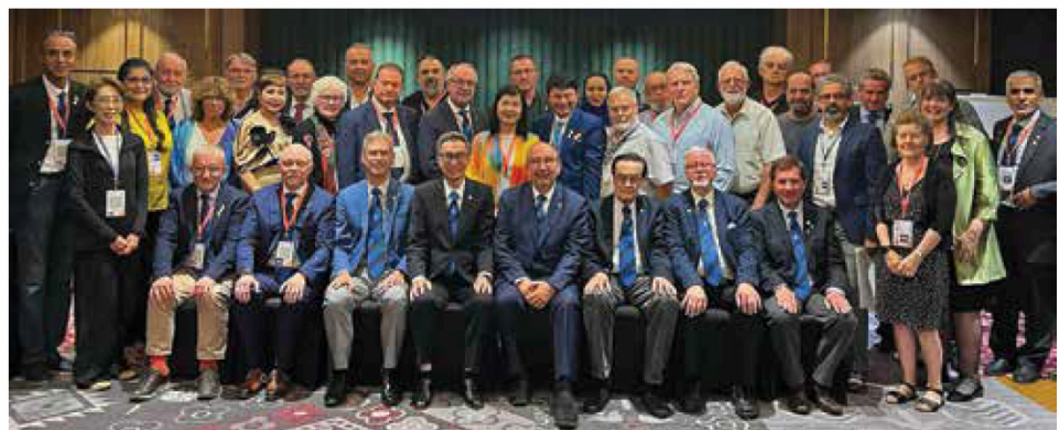
2024 FIAP Congress Liaison Offices & Delegates