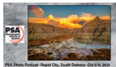
JR Schnelzer Announcing 2021 PSA Photo Festival