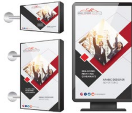
DUPLE SIDE SIGN

We take our work seriously and we provide Creative & professional Signboards in UAE