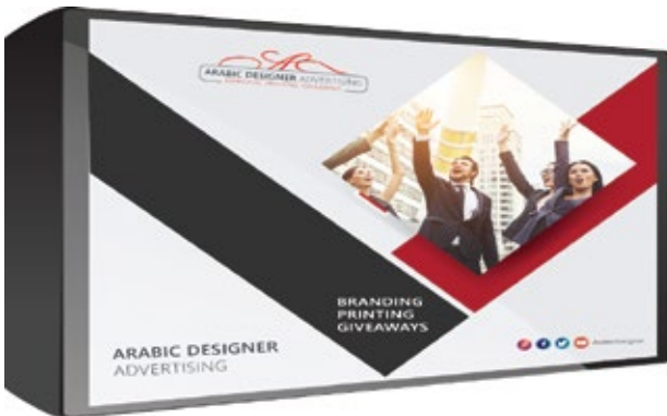
FLEX FACE SIGN