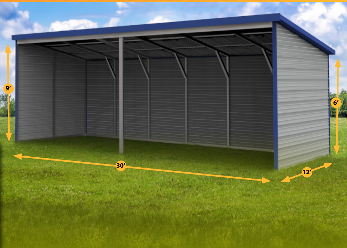
Example shown is 30'x12'x9'x6'