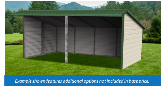
Example shown features additional options not included in base price.