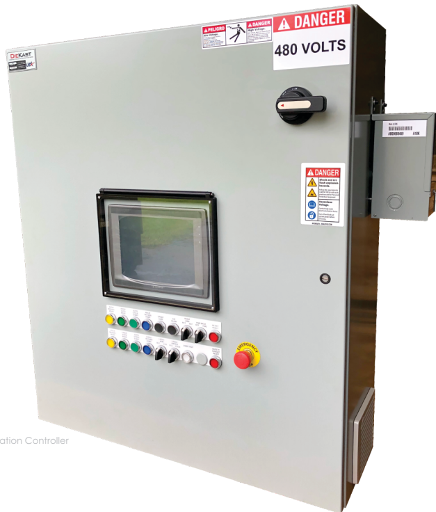
MX Series Combination Controller