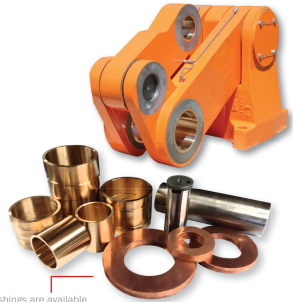
Bushings are available in High Strength M-4 Bronze or OEM Standard Bronze

Our linkage exchange program offers a solution to the costly downtime that results from equipment needing major repairs. We maintain a large inventory of equipment and machine components that are completely remanufactured and ready to ship to your facility when you need it. Our exchange program will save you time and the stress that comes with downtime from major equipment repairs.