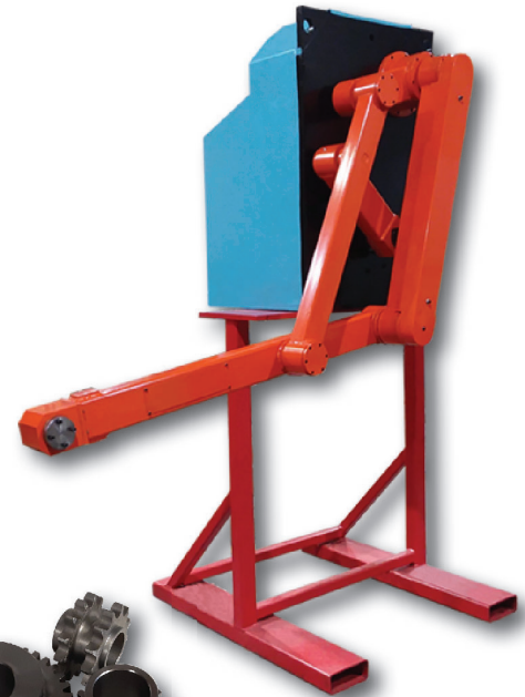
New sprockets and spur gears in stock for replacement parts