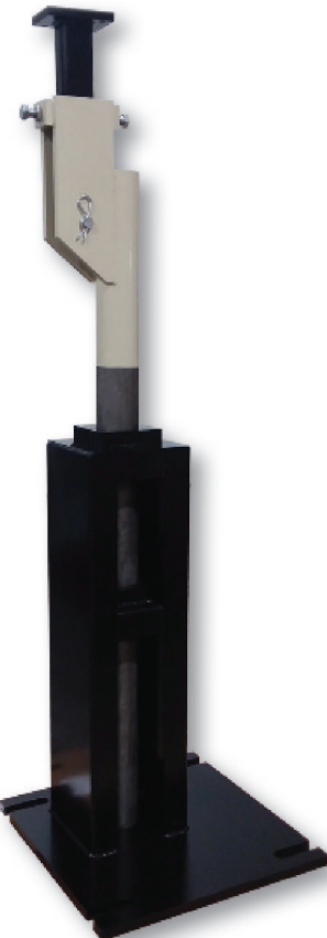
New arm ends in stock for replacement parts, weld style and bolt style