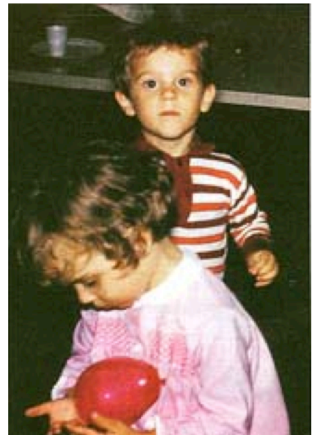
The twins at home, around age 3

But Money was not interested solely in intersexes. As he has stated often in his writings, he saw intersexual syndromes, which he called "experiments of nature," chiefly as a way to learn about the sexual development of so-called normal humans. Thus, he immediately generalized his theories about intersexes to include all children, even those born without genital irregularities. "In the light of hermaphroditic evidence" he wrote in a 1955 paper that would become a classic in the field of sexual development, "it is no longer possible to attribute psychological maleness or femaleness to chromosomal, gonadal or hormonal origins. . . . The evidence of hermaphroditism lends support to a conception that, psychologically, sexuality is undifferentiated at birth and that it becomes differentiated as masculine or feminine in the course of the various experiences of growing up." In simple terms, Money was advancing the view that all children form a