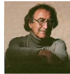
Dr. John Money in 1986

Money's often-overweening confidence actually came to him at some cost. His childhood and youth in rural New Zealand had been beset by anxieties, personal tragedies and early failure. The son of an Australian father and an English mother, he was a thin, delicate child raised in an atmosphere of strict religious observance - or what he has called "tightly sealed, evangelical religious dogma." At age 5 he was bullied by his classmates and took shelter with a female cousin in the girls' play shed, where no boy would be caught dead. "My fate was sealed," he wrote in an anthology titled How I Got Into Sex . "Having not measured up as a fighter, I was set on the pathway of outwitting other kids by being an intellectual achiever. That was easier for me than for most of them."