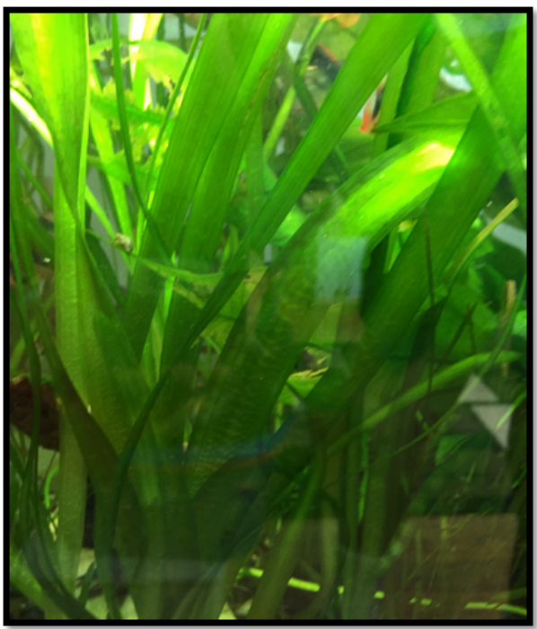
Vallisneria Americana Gigantea