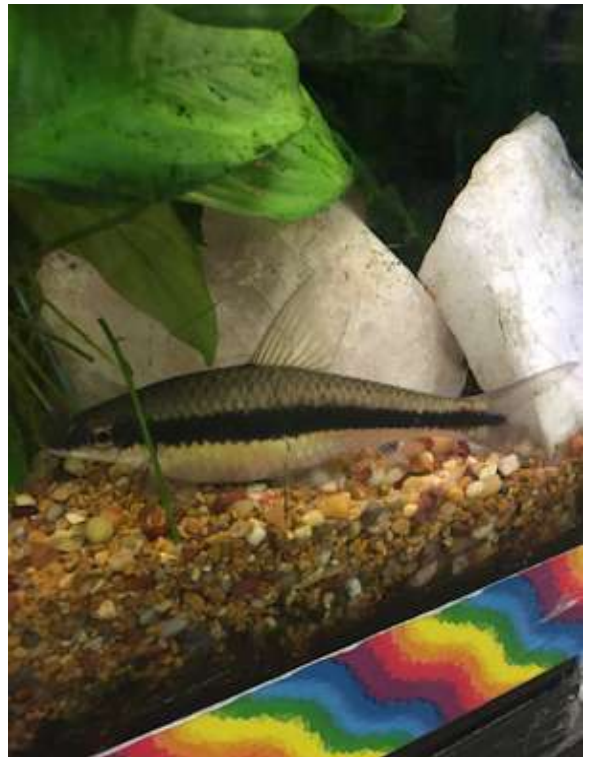
The true Siamese Algae Eater Crossocheilus siamensis