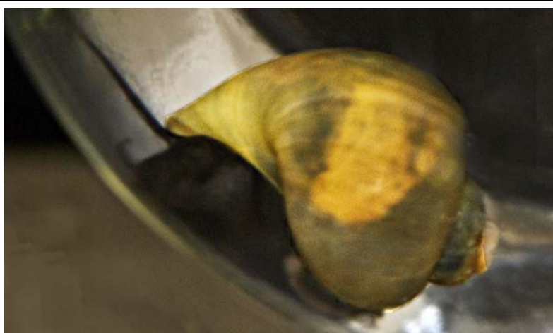
Open Class Senior First Place