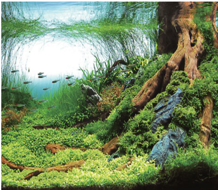
#4. Detail. Full view below.