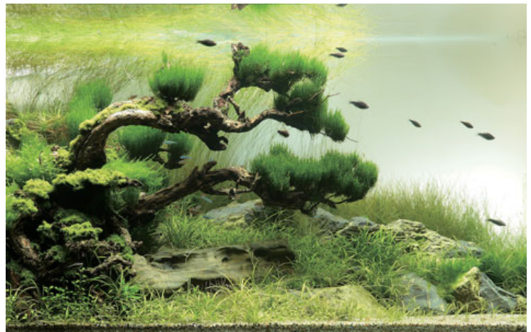
#3. Detail. Full view below. Silver Prize (World Ranking No.3)

Fish & Invertebrates: Paracheirodon axelrodi , Crossocheilus siamensis , Genus Neocaridina , Caridina japonica