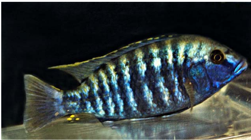
Fish of the Month First Place

Best in Show - C. Carthru with a Yellow Lab/Metallic Blue