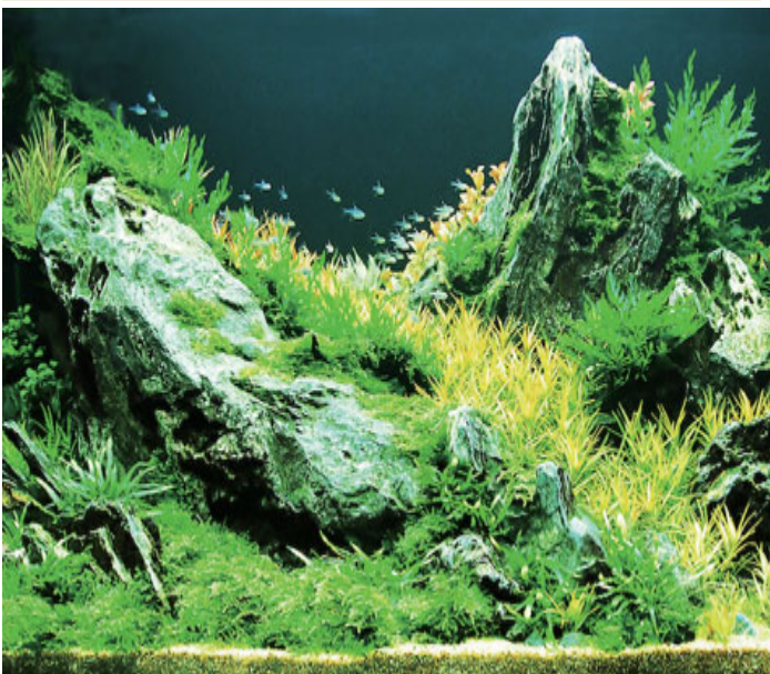
#6. Detail. Full view below. Bronze Prize (World Ranking No.6)

The International Aquatic Plants Layout Contest 2008 was closed for registration on May 31, 2008. A total of 1,170 submissions was received from 47 countries, this year; the number of contest participants outreached the last year's by 28 submissions, but the number of participating countries didn't quite reach last year's record-high 50 countries. The layouts were evaluated by 18 judges chosen internationally, and then, this year's world ranking was decided. The whole grading process was conducted impartially by the judges and so was the counting of scores by the contest committee. However, the evaluation of each judge primarily relies on his/her personal preference of the types of aquatic plant layout. It doesn't necessary become an absolute account of the layout.