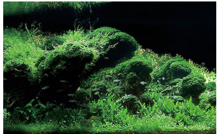
#5. Detail. Full view below.

Fish & Invertebrates: Petitella georgiae , Nannostomus nitidus , Otocinclus macrospilus , Caridina japonica , Caridina cf. serrata "blue tiger"