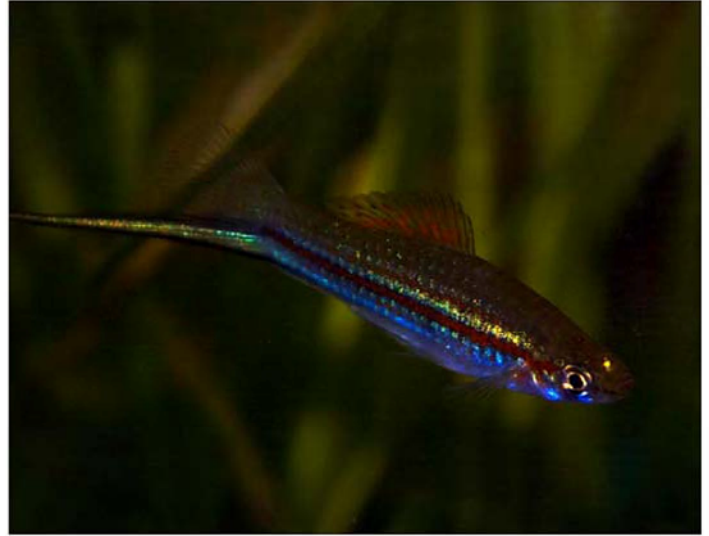
Xiphophorus alvarezii

this makes them grow big and beautiful. The tank gets a one third water change once a week. A few thousand trumpet snails make sure there is no food left over to rot and pollute. Raising good fish is easy. Good food and good water and lots of TLC are all that is needed.