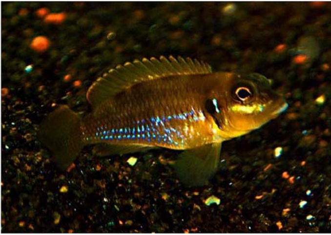
Gold Ocellatus

There are other factors to consider when growing show fish. Plants in the tank use up the fish waste and help to keep the water quality good. Livebearers such as swords, platies and mollies like a lot of vegetable in their diets. One of the reasons my swords grow big is that they are in tanks with Bushynose Plecos and get to eat zucchini every day. My show stopper Blue Rams are just from my community tank with discus, torpedo barbs and some scavengers.