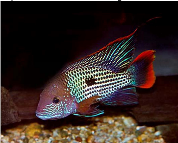
Aequidens sp. Red Edged Acara

There are other factors to consider when growing show fish. Plants in the tank use up the fish waste and help to keep the water quality good. Livebearers such as swords, platies and mollies like a lot of vegetable in their diets. One of the reasons my swords grow big is that they are in tanks with Bushynose Plecos and get to eat zucchini every day. My show stopper Blue Rams are just from my community tank with discus, torpedo barbs and some scavengers.