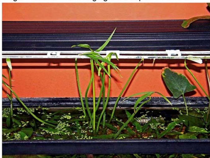
S. Sagittifolia – Week Thirty*

The last surprise of the month for me was the flourishing of my Sagittaria sagittifolia during this last week. The Sagittaria lorata seems to have become dormant, but after the pruning the S. sagittifolia has really started to grow again. I have no idea why this has happened, but it again adds to the changing landscape of this tank.