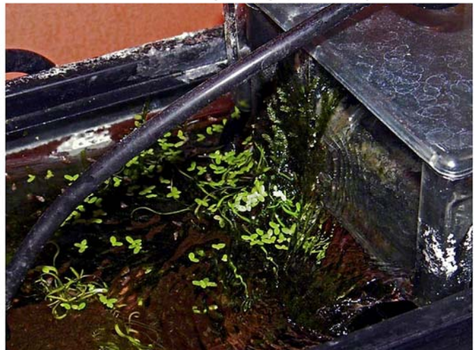
Filter Discharge – Week Twenty-Seven*

One of the plants I brought back from Edmonton was Utricularia graminifolia . A member of the bladderwort family, it can be grown either in the substrate or tied down like some of the aquatic mosses. While it was growing in my tank, I was having a great deal of difficulty in getting it to stay rooted. I had all but given up on it, when one day I was examining my filter out-put. Now, I had actually designed a “chute” of shorts when I was setting up this tank. The reasoning behind this was to allow the water to flow into the tank, rather than form a water-fall which would likely be powerful enough to disturb the substrate in a shallow tank such as this. I had a piece of driftwood from another tank that was naturally shaped like this, and attached it to a piece of slate to ensure that it did not float. While looking at this, I noticed that I had Java moss ( Vesicularia dubyana ) growing on the wood. While this was not a surprise to me, I was surprised with the fact that several strands of the U. graminifolia had actually become entangled with the Java moss and were growing quite nicely.