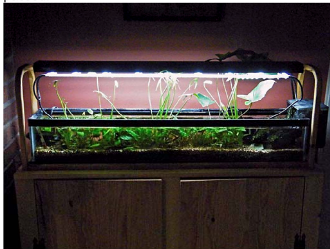
Week Thirty One

First off, here are the pictures of each week that has passed.