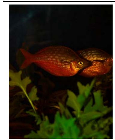
Cover photo of a pair of Glossolepis incisus (New Guinea Red Rainbowfish)

Pg 2 - Club Notes, Executive & BOD List, Membership Dues Pg 3- Presidents Notes, December Anagram, Ads Pg 4 – Editors Notes, General & Business meeting minutes Pg 5-7– Cryptic Emersion 5 & 6 Pg 8 – Member Profile Pg 9 - Scanning the Exchanges Pg 10-11- How To Grow Show Quality Fish Pg-12 – Hagen Ad