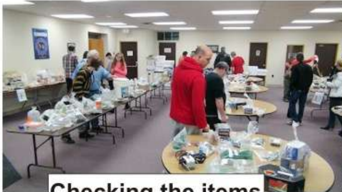
Checking the items