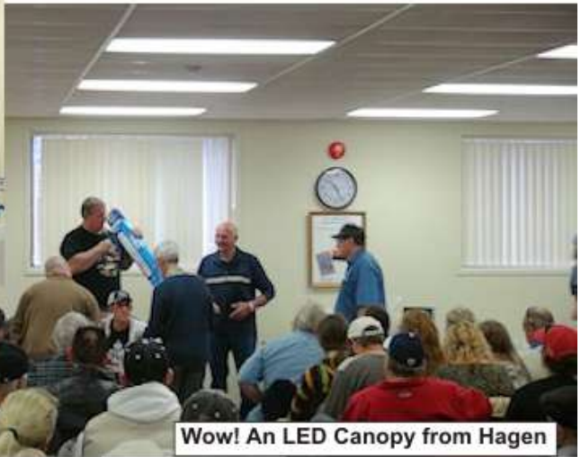
Wow! An LED Canopy from Hagen