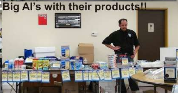
Big Al's with their products!!