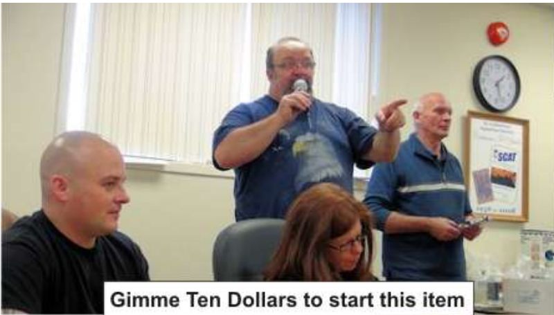
Gimme Ten Dollars to start this item