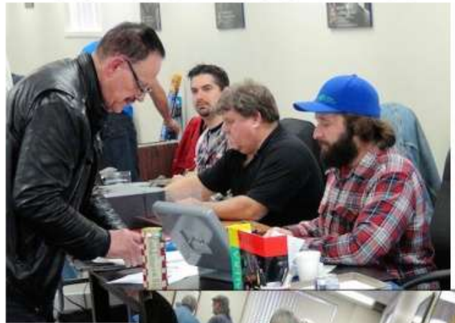
← and our amazing runners