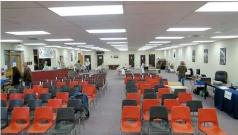
Before the Crowd ...