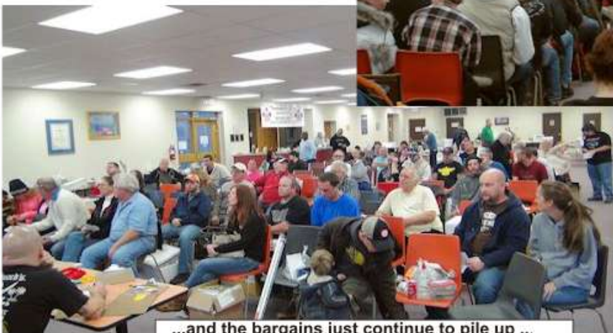
...and the bargains just continue to pile up ...

... to the end. Thanks to the workers, the sellers, the buyers the auctioneers, ..... Everyone!!