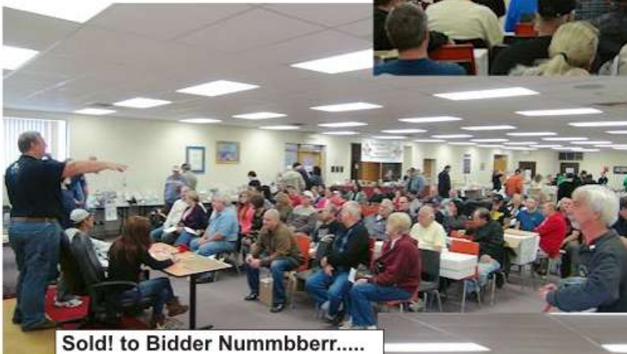
Sold! to Bidder Nummberr....