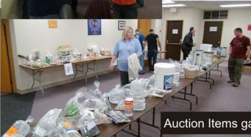
Auction Items galore!