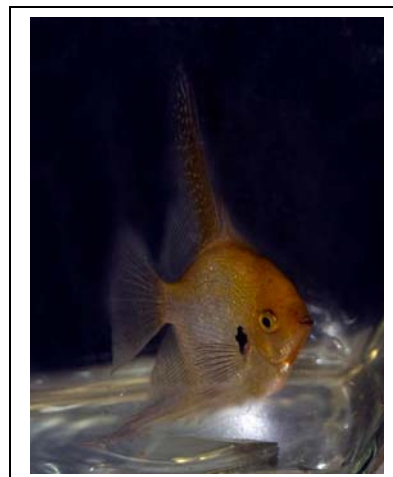
Cover photo of a Gold Angel from the April Jar Show

Pg 2 - Club Notes, Executive & BOD List, Membership Dues Pg 3- Editors notes, Presidents Notes Pg 4 – Member Profile Pg 5 – Scanning the Exchanges Pg 6 – Cryptic Emersion part 2 Pg 8 – CAOAC Show Entry Pg9 – Jar Show Rules Pg10 – Jar Show Results Pg 11 - SCAAS Auction Photos Pg 12 – What SCAAS Members are Keeping Pg 14 – Hagen Ad