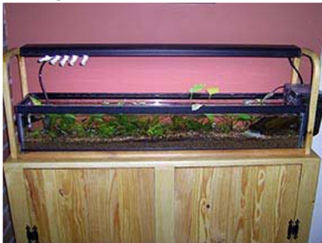
Week # 8

The initial Anubias hastifolia has thrown another new leaf that has broken the surface. There were no other negative developments.