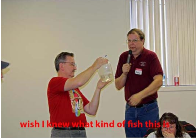
wish I knew what kind of fish this is