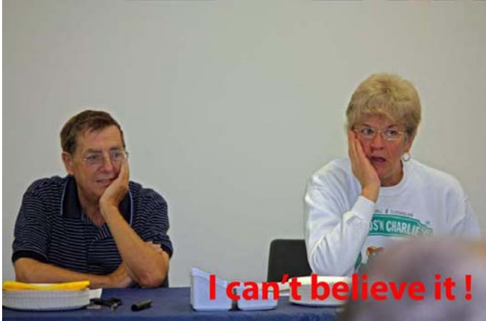
I can't believe it!