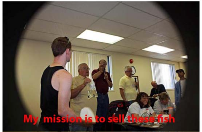
My mission is to sell these fish