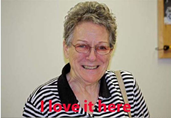
I love it here