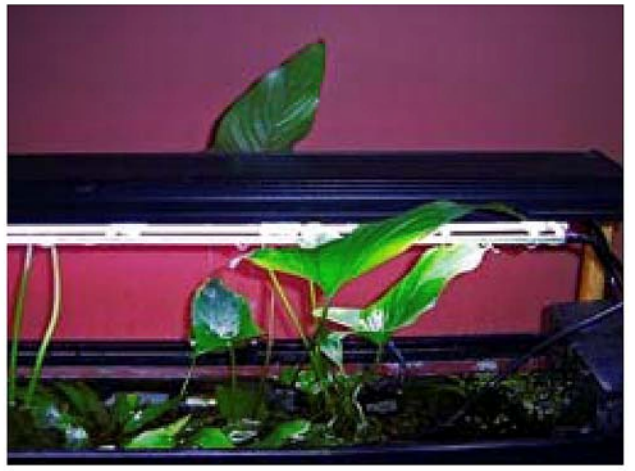
A. Hastifolia Week 25*

The other plant that has surprised me in the last four weeks is the A. hastifolia . While it has been doing exceedingly well, the growth over the last month has amazed me, with two leaves being above the lights as of week 26.