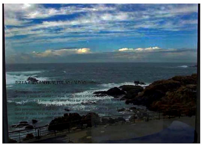
onto the window glass itself; it was the unobstructed view of the sea and the pounding surf that mesmerized. Home is out there and Chris came here to report finding it in 1492.

Bumble Bee cichlids are mouth brooders, and prefer to spawn in caves or around rock work, but