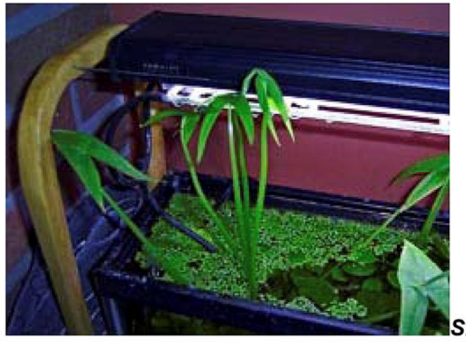
Sagittifolia – Week 24* So, that is where I stand at week 26, half-way into my year long experiment. Only another six months to go...

Finally, over a week period there was an impressive growth spurt of Salvinia rotundifolia . If you look at the following picture and compare it with the background of the S. saggitifolia above, you can see that in the period of one week, it multiplied rapidly. If anyone has any suggestions on why I had such rapid growth in such a small period of time, I would be grateful to listen.