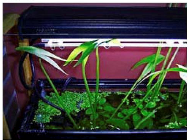
S. Sagittafolia – Week Twenty-Three*

browning around the margins, the leaves are very beautiful. If you look at the four pictures in the above series, you can see the rapid growth of the leaves. Another thing that surprises me about this plant, both in this tank and two of my other tanks, is the tendency for the leaves to grow curved or bent to allow the arrow-head leave to stay as close as possible to the light source.