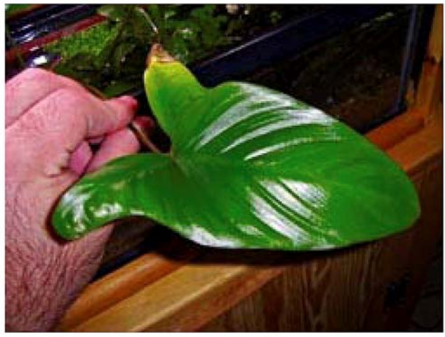
A. Hastifolia Week 23 Close-up 1*

Along with the height of the leaves, the size of the leaves is also impressive.