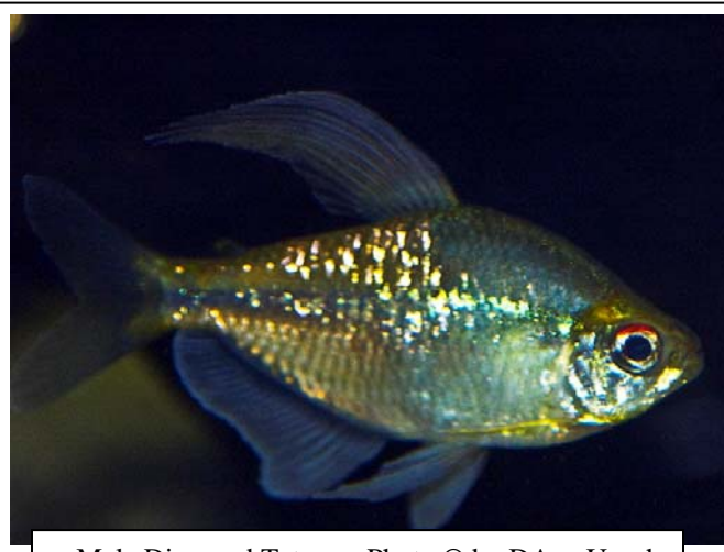
Male Diamond Tetra