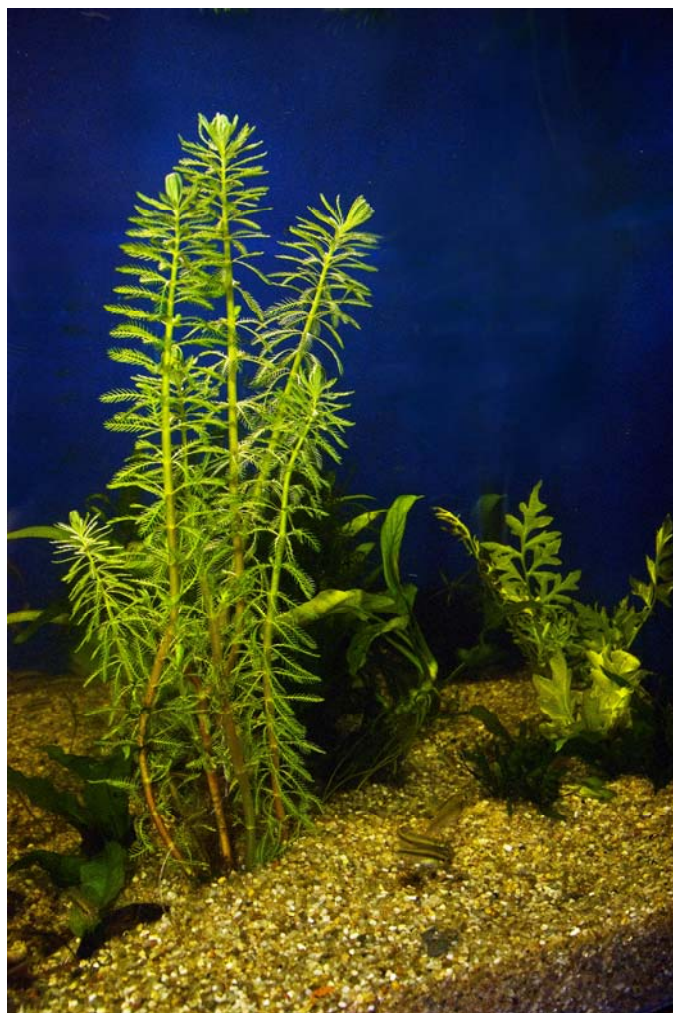
Submersed form

best as an emersed form, it still does well as a submersed form. To keep it in its submersed form all one has to do is too cut off the part of the plant that is above the water line. The cut off part can be planted in the substrate of the aquarium and will start another plant. About the only thing it needs is bright light. If the light is not bright enough it will grow into a scraggly looking plant. It is a good plant for the sides and back of the aquarium as it will grow tall, but it must be trimmed regularly to keep it in its submersed form. Otherwise it will begin forming shoots at the surface of the water and growing out of the aquarium.