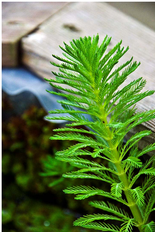
Emersed form of Parrots feather

This plant is quite common and usually found in most stores. But for some reason I have never bought this plant. This summer I happened upon it and decided to buy a few to put in my barrel ponds. It is an attractive plant, particularly when it grows out of the water.