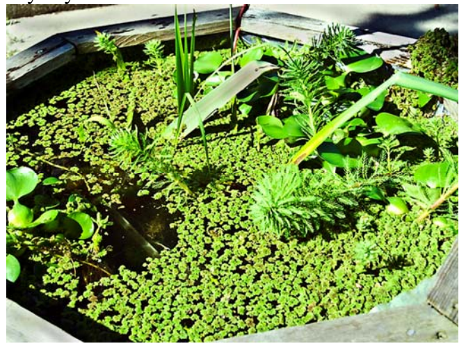
Green Azolla caroliniana

This plant was one that I bought at an auction last year. It was labelled as frogbit and so I bid on it as I wanted some frogbit for my small barrel ponds. I did not see this bag earlier so I hoped that the seller was actually selling what was written on the bag. My bid was the winning one and so after signing for the bag I took a close look inside the bag. I was disappointed as it definitely was not frogbit. There was a lot of common duckweed in the bag and a small floating plant that I could not identify. I kept the bag with the mystery plant anyway.