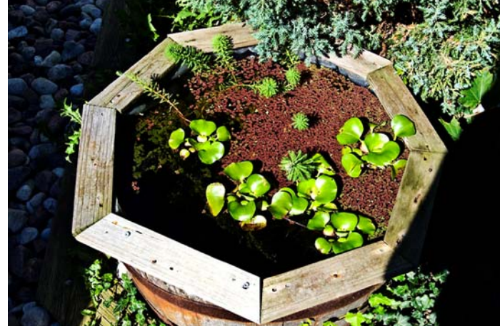
Red Azolla caroliniana

When I got home I threw the contents of the bag into a tank that did not have any floating plant. It seemed that it was mostly duckweed (which I hate to have in my tanks). Duckweed spreads very quickly & ends up blocking most of the light. So I threw out as much of the duckweed as I could and kept the mystery plants.