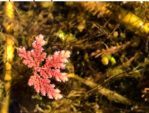
Close-up of a single plant

I did a bit of research to find a name for this plant and I have tentatively identified it as Azolla caroliniana . It is very attractive floating plant, but it spreads quickly.