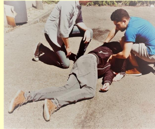
Primary and secondary assessment.

Cost: £ 120 per delegate (£100 for 2-day requal).