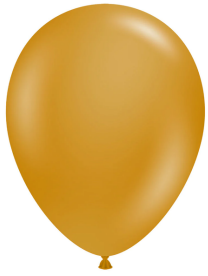
METALLIC GOLD (T)