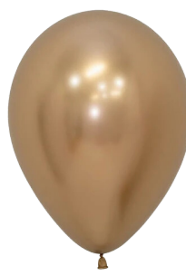
MIRROR GOLD (K)