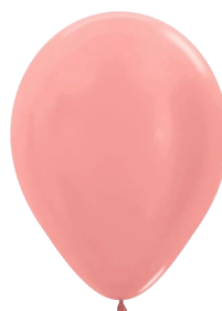
METALLIC ROSE GOLD (S)