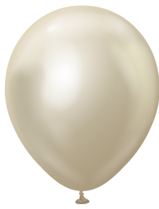
MIRROR WHITE GOLD (K)