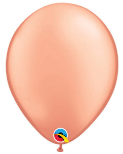
ROSE GOLD (Q)