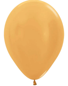
METALLIC GOLD (S)