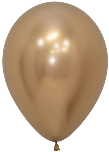
REFLEX GOLD (S)