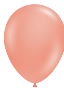
METALLIC ROSE GOLD (T)