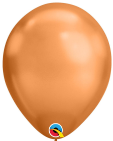
CHROME COPPER (Q)