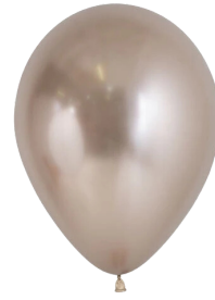
REFLEX CHAMPAGNE (S)