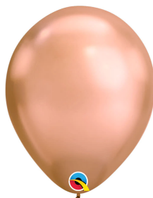
CHROME ROSE GOLD (Q)