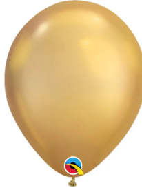
CHROME GOLD (Q)