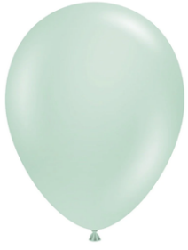
EMPOWER MINT (T)