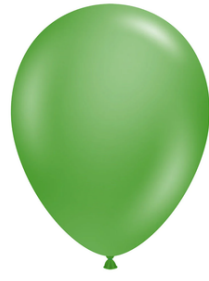
METALLIC GREEN (T)