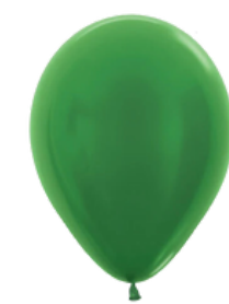
METALLIC GREEN (S)