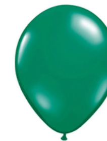
EMERALD GREEN (Q) *transparent*