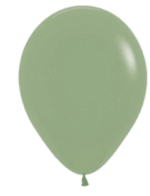
DELUXE EUCALYPTUS GREEN (S)