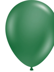
METALLIC FOREST GREEN (T)