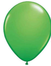
SPING GREEN (Q)