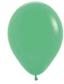
FASHION GREEN (S)