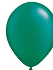
EMERALD GREEN *pearl*