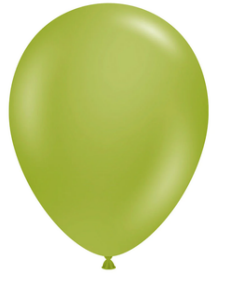
FIONA GREEN (T)