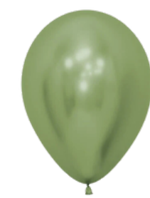
REFLEX KEY LIME GREEN (S)