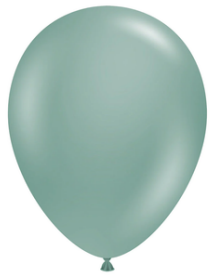
WILLOW GREEN (T)