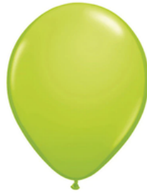
LIME GREEN (Q)