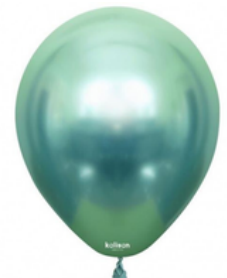
MIRROR GREEN (K)