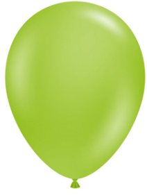
LIME GREEN (T)