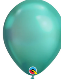
CHROME GREEN (Q)