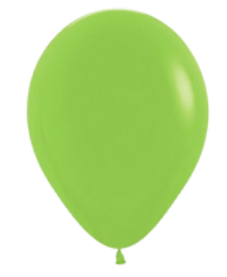
KEY LIME GREEN (S)