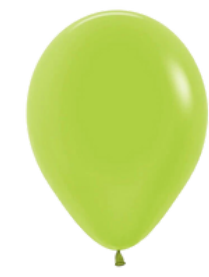
NEON GREEN (S)