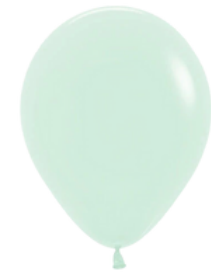
PASTEL MATTE GREEN (S)