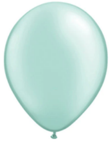
PEARL MINT GREEN (Q)