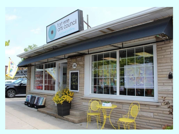
Visit our website

Come, Visit and SHOP Let's support our local artists and community.