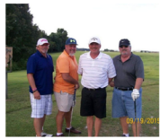
2011 Ladies Tournament