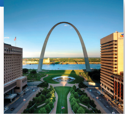
Museum of Westward Expansion St. Louis