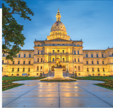
Michigan State Capitol Lansing