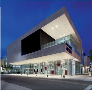
Royal Alberta Museum Edmonton