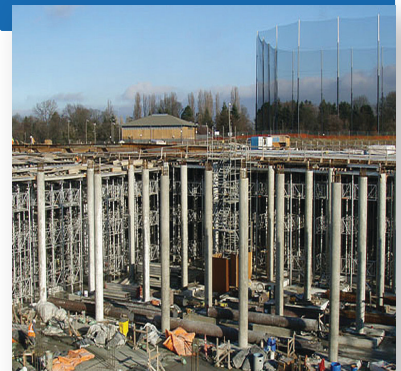
Beacon Hill Reservoir Seattle