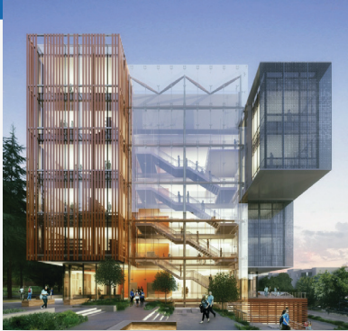
University of Washington Seattle