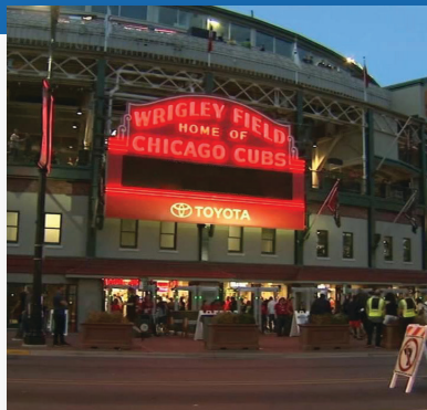
Wrigley Field Chicago