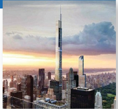
Nordstrom Tower New York