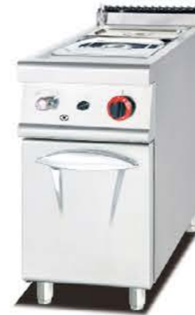
GH-974/774Z / EH-874Z/774Z Gas / Electric Bain Marie With Cabinet