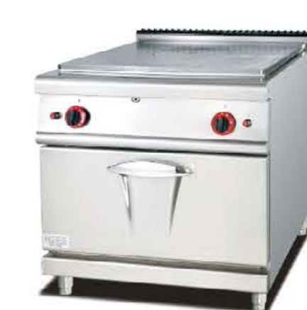
GH-983A / 783A Gas French Hotplate With Oven