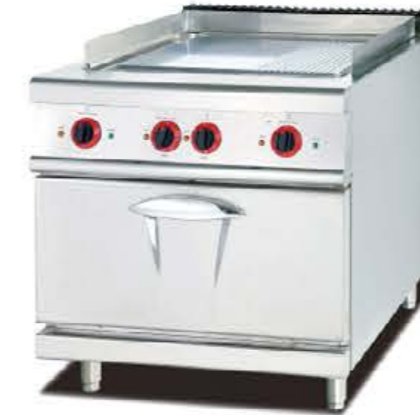
EG-886A / EG-786A(700) Electric Griddle With Oven