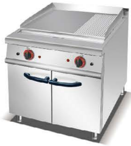
FSE-906 / FSE-706