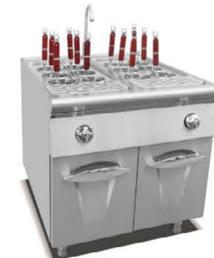
FS900-RM-12 Gas Pasta Cooker With Cabinet