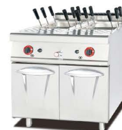
GH-988C / GH-788C(700) Gas Pasta Cooker With Cabinet