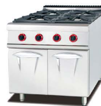
GH-987 / GH-787(700) Gas Range With 4-Burner Cabinet