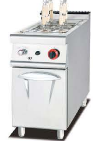
GH-978/778 / EH-878/778 Gas / Electric Pasta Cooker With Cabinet