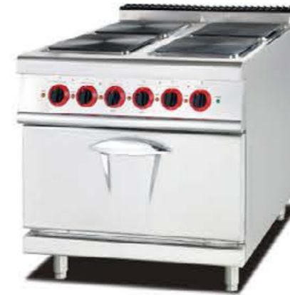
EH-887A Electric Range With 4-Hot Plate & Oven