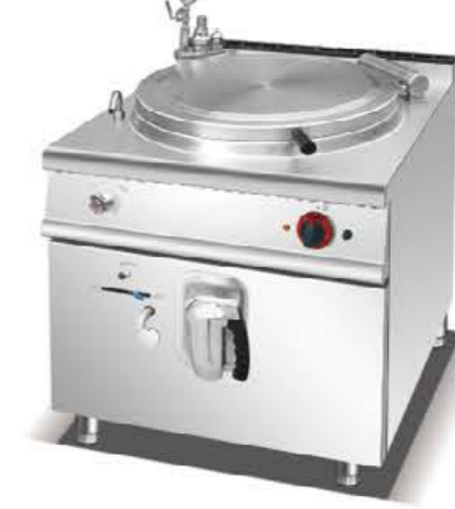
FSE-TO-100 / FSE-TO-60