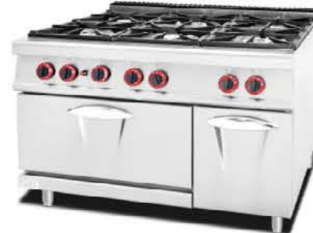
GH-997A / GH-797A(700) Gas Range With 6-Burner & Oven