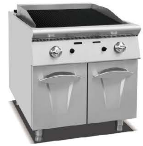
FS900-RH Gas Grill With Cabinet