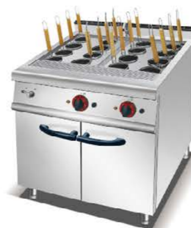
Model: FSE-910 / FSE-710