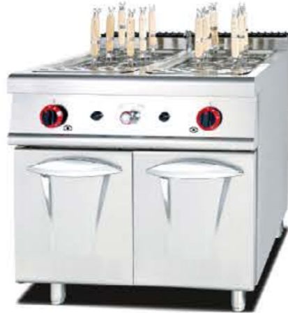
GH-988 / GH-788(700) Gas Pasta Cooker With Cabinet