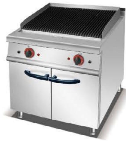
FSE-907 / FSE-707