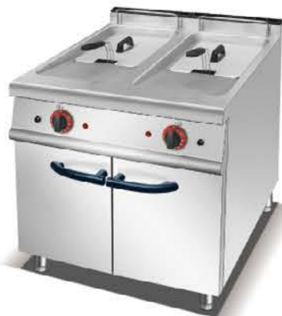
Model: FSE-908 / FSE-708