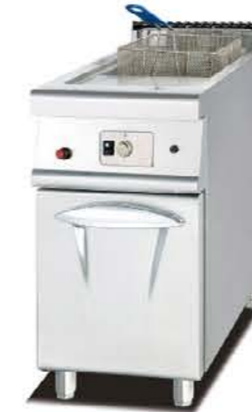
GF-975/775 / DF-875/775 Gas / Electric Fryer With Cabinet