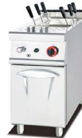
GH-978C/778C / EH-878C/778C Gas / Electric Pasta Cooker With Cabinet