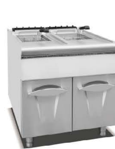
FS900-RZ-2 Gas Fryer With Cabinet