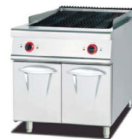
EB-889 / EB-789(700) Electric Lava Rock Grill With Cabinet