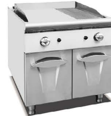
FS900-RG Gas Griddle (2/3 Flat, 1/3 Grooved) With Cabinet