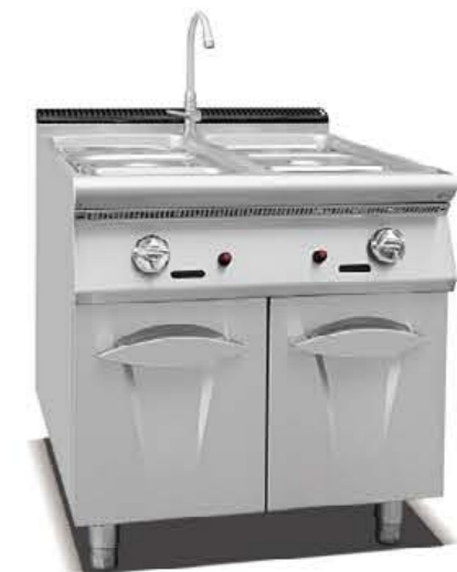
FS900-RB Gas Bain Marie With Cabinet