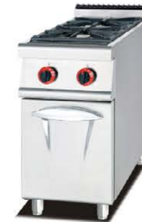
GH-997/777 Gas Range With 2-Burner