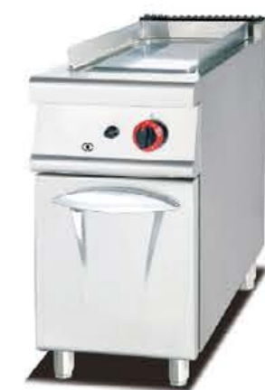
GH-976/776Z / EH-876Z/776Z Gas/Electric Griddle With Cabinet