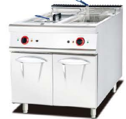
EG-885 / EG-785(700) Electric Fryer (2-Tank & 2-Basket) With Cabinet