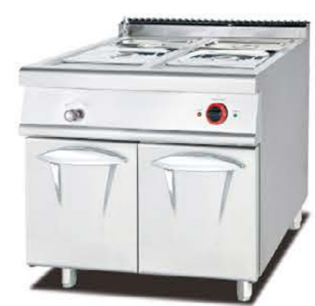
EH-884 / EH-784(700) Electric Bain Marie With Cabinet