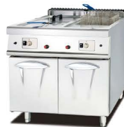
GF-985 / GF-785(700) Gas Fryer (2-Tank & 2-Basket) With Cabinet