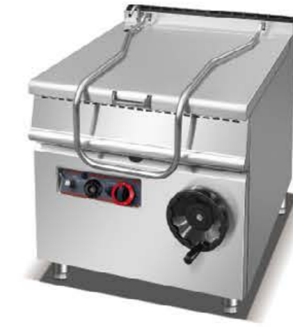
FSE-TS-80 / FSE-TS-60