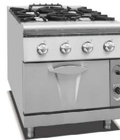
FS900-RQ-4 Gas 4-Burner Range With Oven