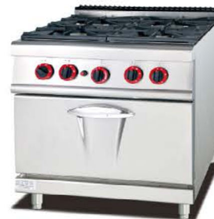
GH-987A / GH-787A(700) Gas Range With 4-Burner & Gas Oven