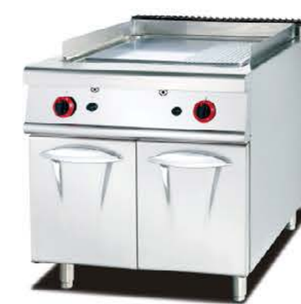
GH-986C Gas Griddle With Cabinet (1/3 Grooved)