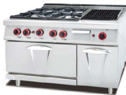
GH-999A / GH-799A(700) Gas Range With 4-Burner & Lava Rock Grill & Oven