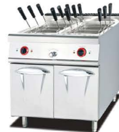
EH-888C / EH-788C(700) Electric Pasta Cooker With Cabinet