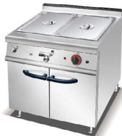
Model: FSE-909 / FSE-709