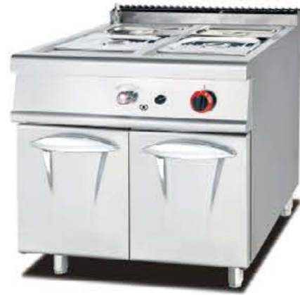
GH-984 / GH-784A(700) Gas Bain Marie With Cabinet