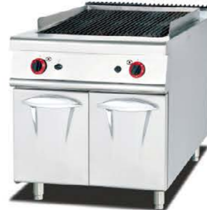
GH-989 / GH-789(700) Gas Lava Rock Grill With Cabinet