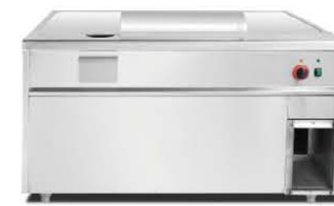
HEG-1200 / HEG-1500 Electric Teppanyaki (Griddle)