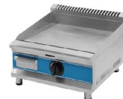
HGG-500 Gas Griddle