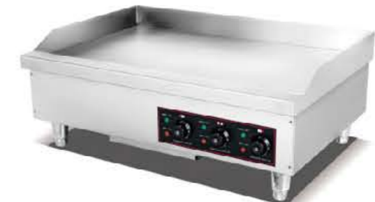
HEG-824 / HEG-836 HEG-848