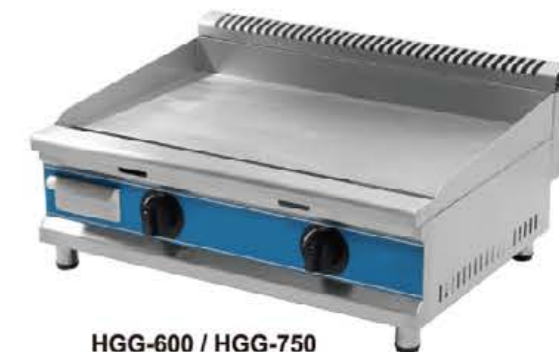
HGG-600 / HGG-750 HGG-900 / HGG-1100 Gas Griddle