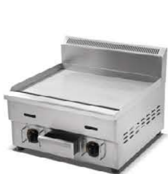
GT-600 / GT-700 GT-750-2(Half grooved)