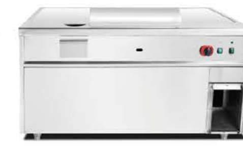
HGG-1200 / HGG-1500 Gas Teppanyaki (Griddle)