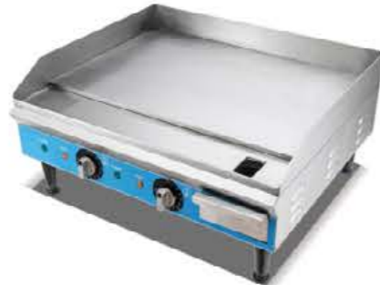
HEG-510/HEG-610 Electric Griddle