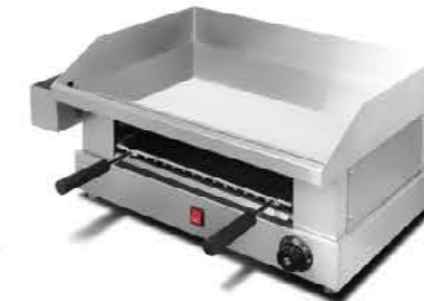
HEG-580 Electric Griddle & Salamander