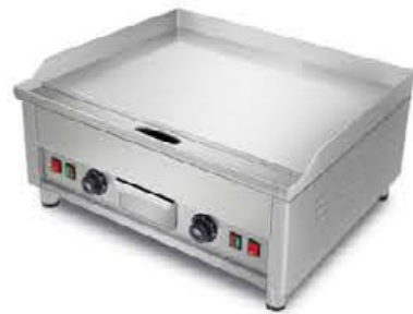
HEG-450D/HEG-650D Electric Griddle