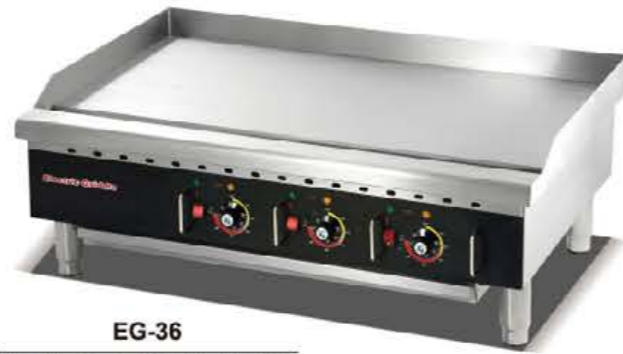
EG-36 Usa Giant-size Electric Griddle