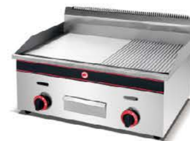
HGG-722 Gas Griddle