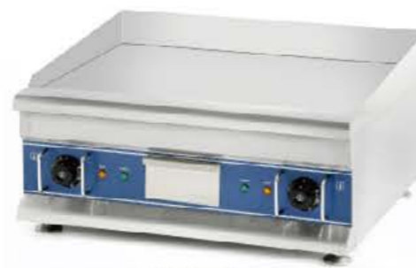
HEG-600 HEG-750 / HEG-1000