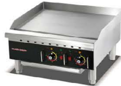
EG-24 Usa Giant-size Electric Griddle