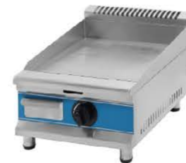
HGG-350 Gas Griddle