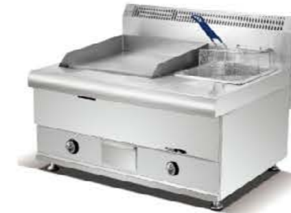
HGG-751 / HEG-908 Gas Griddle With Gas Fryer/ Electric Griddle With Electric Fryer