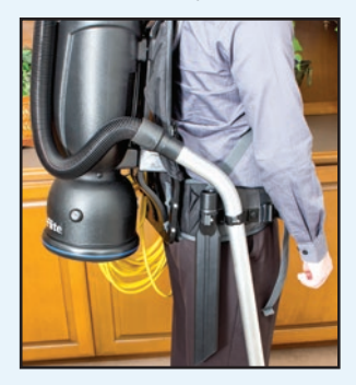
"Hands Free" system allows storing of the tools, including the wand, right on the belt for user convenience.