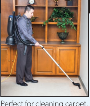
Perfect for cleaning carpet, hard floors and above floor cleaning.