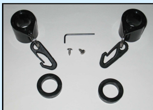
Never Furl package components (Available in white or black molded plastic)

Compare for yourself to other products on the market, including so-called spinner flags and see the difference with this unique, innovative design!