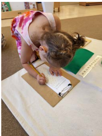
A student working hard on her addition table of 5.

The children have made new friends and happily reunited with old friends. Our class is normalized, and everyone is participating during morning group time. We are counting to the 100 th day of school and all students are actively working in the Math and Language areas of the classroom. What an amazing start to our school year!