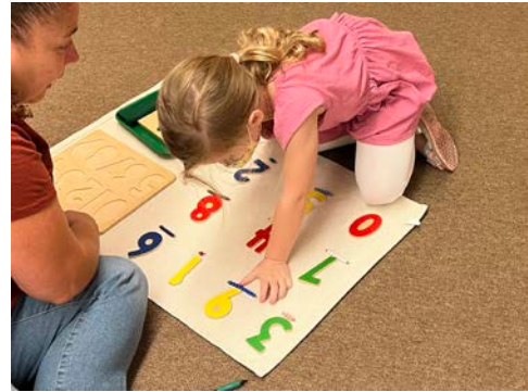
Ava working on number and color bead stair extension work.

Zoology-We have learned the differences between living and non-living things, plants and animals and vertebrate and invertebrate animals. The children are enjoying working with small objects and sorting them.