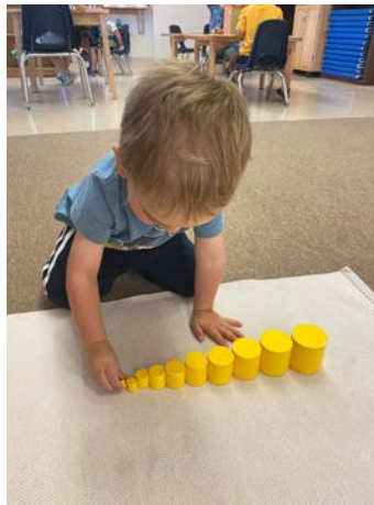
A student working with the yellow knobless cylinders.