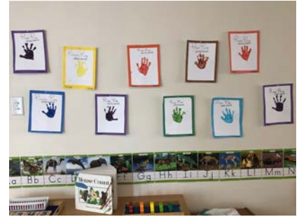
Artwork done by the Pinon Pine classroom.

Lessons have been given on several works off the shelves and the children have been encouraged to work independently. They are now building a sense of order and responsibility for their work and classroom.