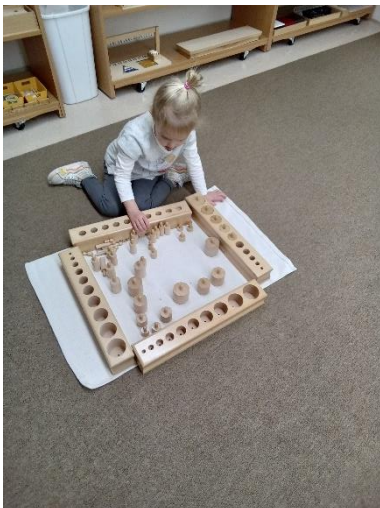
Adalena working with the Knobbed cylinders 1-4 in the sensorial area of the classroom.

In the month of January , we will be focusing on getting reacclimated to the environment and back into our daily routine. After a long break, the children always return ready and eager to learn.