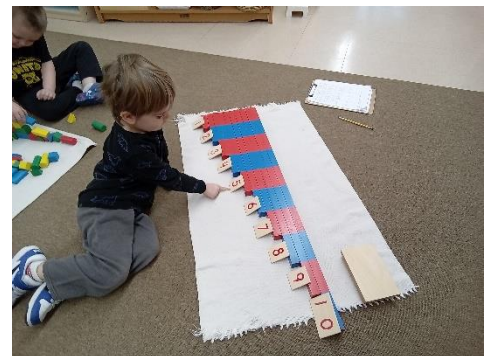
Lars working with the number rods and cards.

We will be starting our unit on animal tracks. The children will be learning facts about different animals that live in the mountains and investigate their tracks. This unit of study will lead us into Arctic and Antarctic animals that live where it is cold.