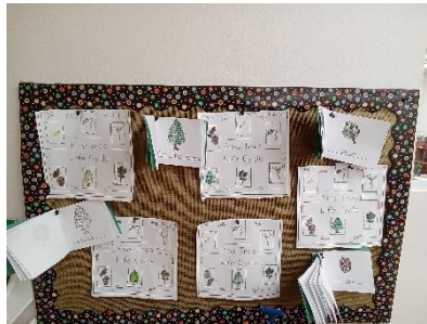
The Life cycle of a Pine Tree work done by the students.

In January , we will detect different animal tracks and find out what do animals do in the winter. We will also talk about what camouflage and hibernation mean.