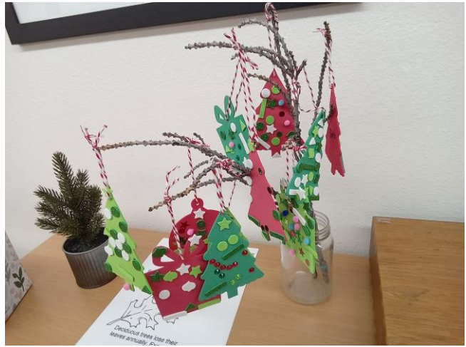
Holiday artwork done by the students.