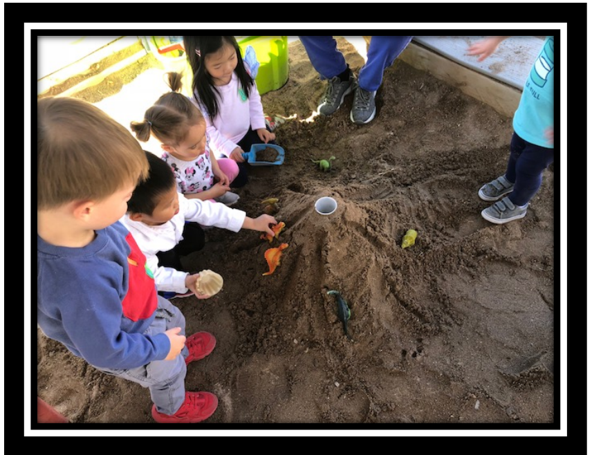
The 2-4 year old classroom enjoys building a volcano and using their dinosaurs with it!