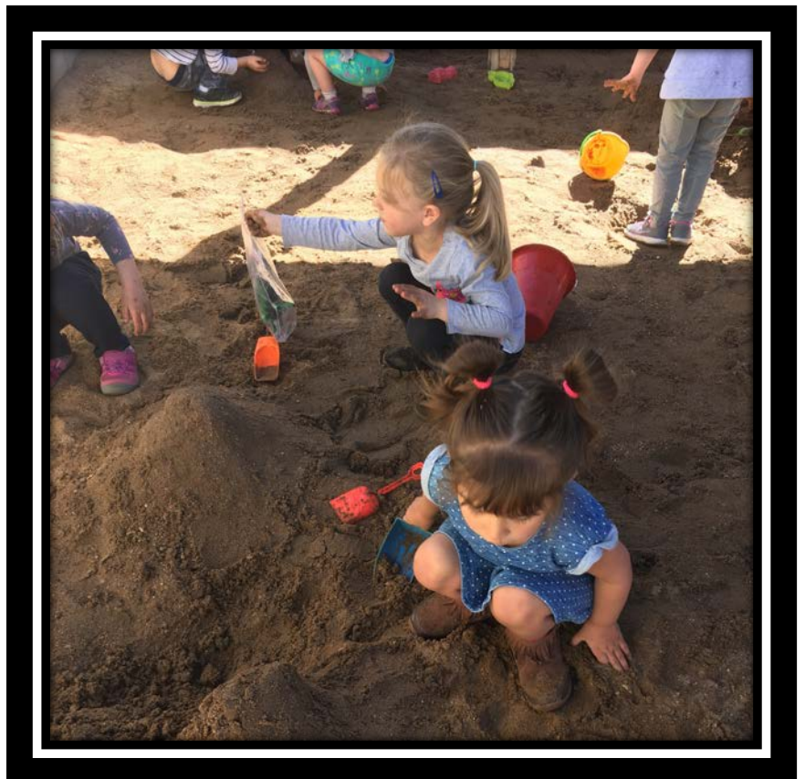
Both the 3-6 & Transition classrooms combined and enjoyed working together!