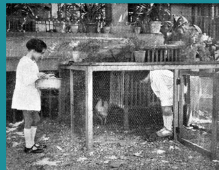
Children caring for the aviary, Barcelona, 1930s

The NAMTA Journal • Vol. 38, No. 1 • Winter 2013