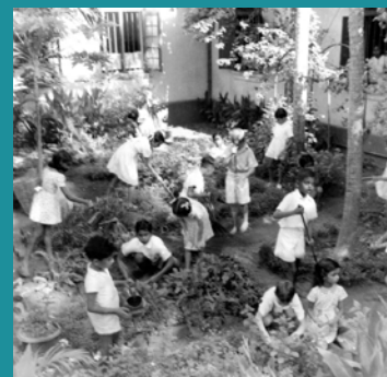
In the school garden, Sri Lanka, 1940s

“This piece of writing addresses the “boundless” garden created through the web of foresight and patience combined with the spontaneous activity necessary for growing food and harvesting the bounty. Most will be familiar with this unique writing by Montessori who suggests that it is not the work and actual produce of the garden but the activities of “living naturally” that enhance the child’s development”.