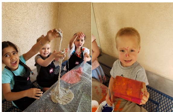
Discovery and Art Exploration