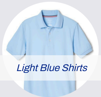
Light Blue Shirts

All shirts, jumpers, sweaters, vests, and PE attire must have the school crest (left side)