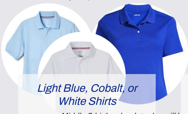
Light Blue, Cobalt, or White Shirts

All shirts, jumpers, sweaters, vests, and PE attire must have the school crest (left side)