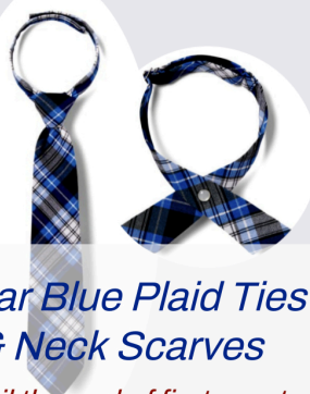
Clear Blue Plaid Ties & Neck Scarves