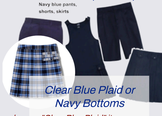
Clear Blue Plaid or Navy Bottoms

Middle & high school grades will have until the end of first quarter to order new "Clear Blue Plaid" items. Our online vendors are working to get these items added to their stores.