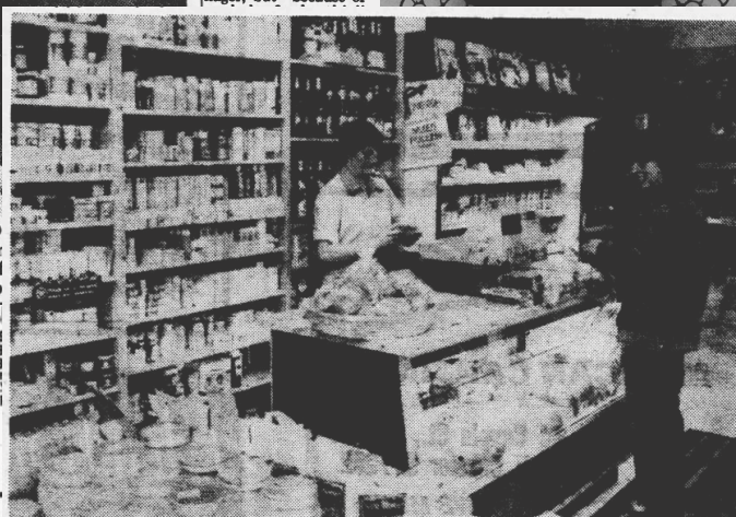
The interior of Duttons Health Food Stores in Godstall Lane.