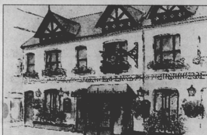
PLANNED PUB: An artist's impression of what Duttons will look like. Graphic by DONNA HARTLEY DESIGNS LTD

The court heard a tenant acting in conjunction with JW Lees already held a full licence for the premises, granted by magistrates in 1993, which