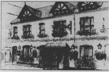
PLANNED PUB: An artist's impression of what Duttons will look like. Graphic by DONNA HARTLEY DESIGNS LTD

The court heard a tenant acting in conjunction with JW Lees already held a full licence for the premises, granted by magistrates in 1993, which