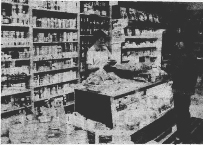
The interior of Duttons Health Food Stores in Godstall Lane.

DUTTONS Health Foods Designed to provide a specialist service for your Good Health SITUATED IN GODSTALL LANE