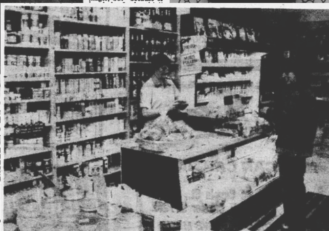
The interior of Duttons Health Food Stores in Godstall Lane.