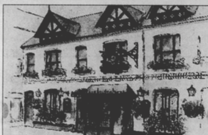
PLANNED PUB: An artist's impression of what Duttons will look like. Graphic by DONNA HARTLEY DESIGNS LTD

The court heard a tenant acting in conjunction with JW Lees already held a full licence for the premises, granted by magistrates in 1993, which