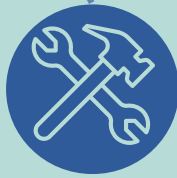
Building & Construction