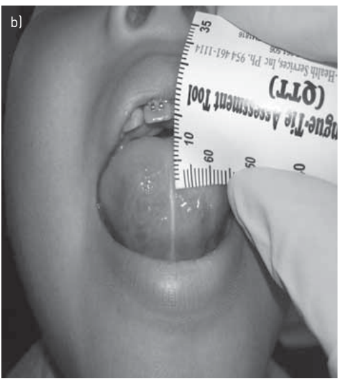
FIGURE 1 Measurement of the frenulum using the commercially available Quick Tongue Tie Assessment Kit (Neo Health Services Inc., Coconut Creek, FL, USA). a) Normal frenulum [9]; b) free tongue [7]. Complete clinical protocols for lingual frenulum investigations for infants [13] and children-adolescents [25] have been published.

All variables were anonymised and submitted for statistical analysis. The continuous variables are presented as mean±sp. A normality test was performed on all continuous variables. If the variables were distributed normally, the paired t-test was used; otherwise, the Wilcoxon rank sum test was computed. A p-value <0.05 was considered statistically significant.