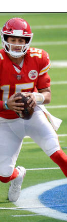
Patrick Mahomes and the Chiefs will face the Ravens on Monday Night Football at 8:15 p.m. on ESPN.