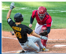
Season over The Pirates ended the shortened season with a loss in Cleveland. B2