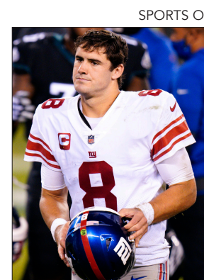
Daniel Jones and the Giants will host the Buccaneers on Monday Night Football at 8:15 p.m. on ESPN.