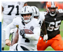
Browns go down Cleveland lost to the Raiders in windy, snowy conditions. B2