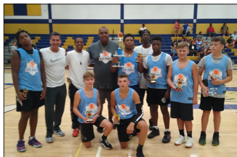
7th-8th grade boys champion: Addison-Clifton.