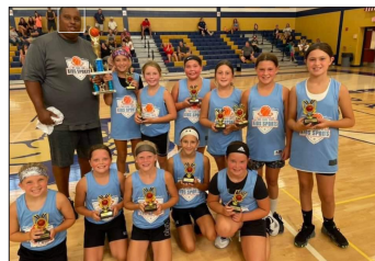
3rd-4th grade girls champion: Ford Business Machines.