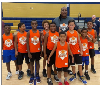
3rd-4th grade boys champion: Addison-Clifton.

So the question needs to be asked: Will there be a We Care for Kids Sports