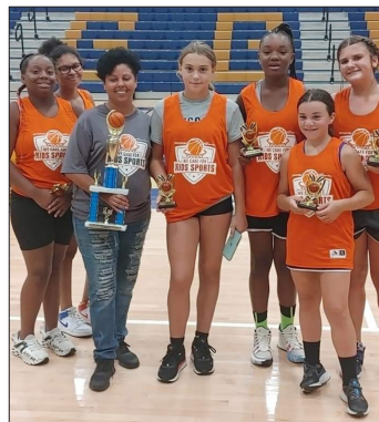
5th-6th grade girls champion: RKB Electric.