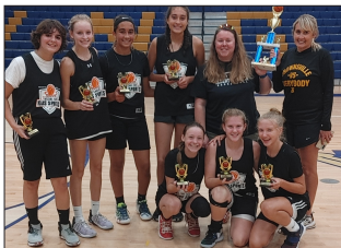
7th-8th grade girls champion: Addison-Clifton.

"It's not just the pitchers there. There are position players there too that we hope he plays with in the future. It's not the only place we have players that we believe in and care about a lot; we have those guys at every one of the levels. It just happened to fit where there's some playing time behind the dish. We think it's a level he can go to and compete. It's a big jump. College baseball, a little bit of a break, and now into High-A. Not easy. It'll be challenging. He's certainly up for a challenge. We think it will be productive for him and us as we plan for offseason and next year."