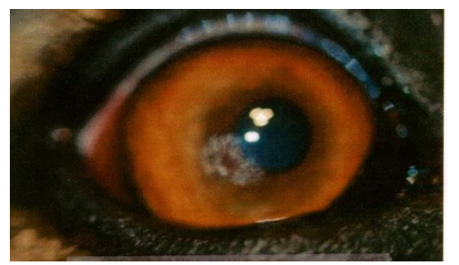
Corneal Dystrophy can lead to painful ulceration.

Hypothyroid dogs are often obese or have a difficult time losing weight. They can be lethargic , or appear "mentally dull," lacking desire to work or play.Some hypothyroid dogs don't show obvious skin or behavior changes. Non-regenerative anemia and high cholesterol levels may raise suspicion of thyroid disease. Elevated cholesterol( found in 65-80% of hypothyroid dogs) and circulating fats can lead to changes in the eye. Corneal dystrophy is an abnormality of the clear covering of the eye. It can appear as a small white spot or circle on the eye's surface. Severe forms can lead to painful ulceration.