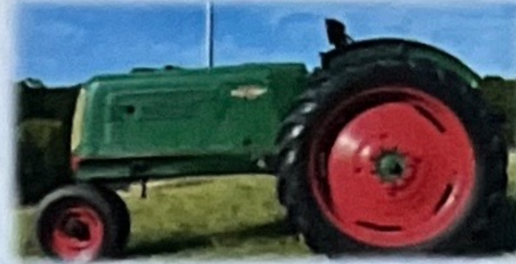
1948 Oliver 70 Row Crop