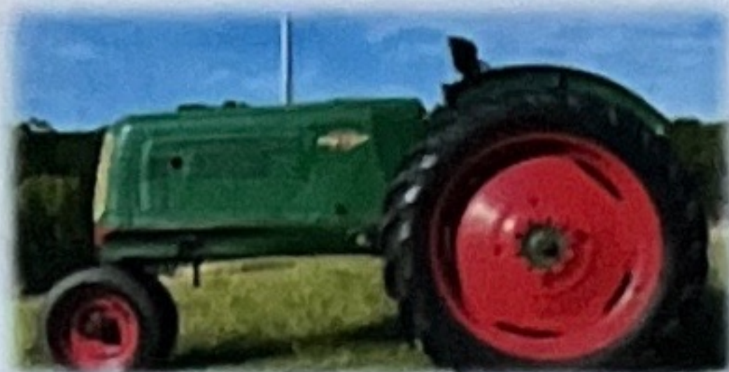
1948 Oliver 70 Row Crop