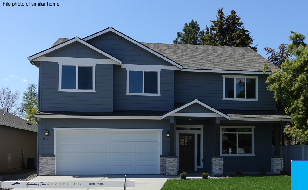
File photo of similar home