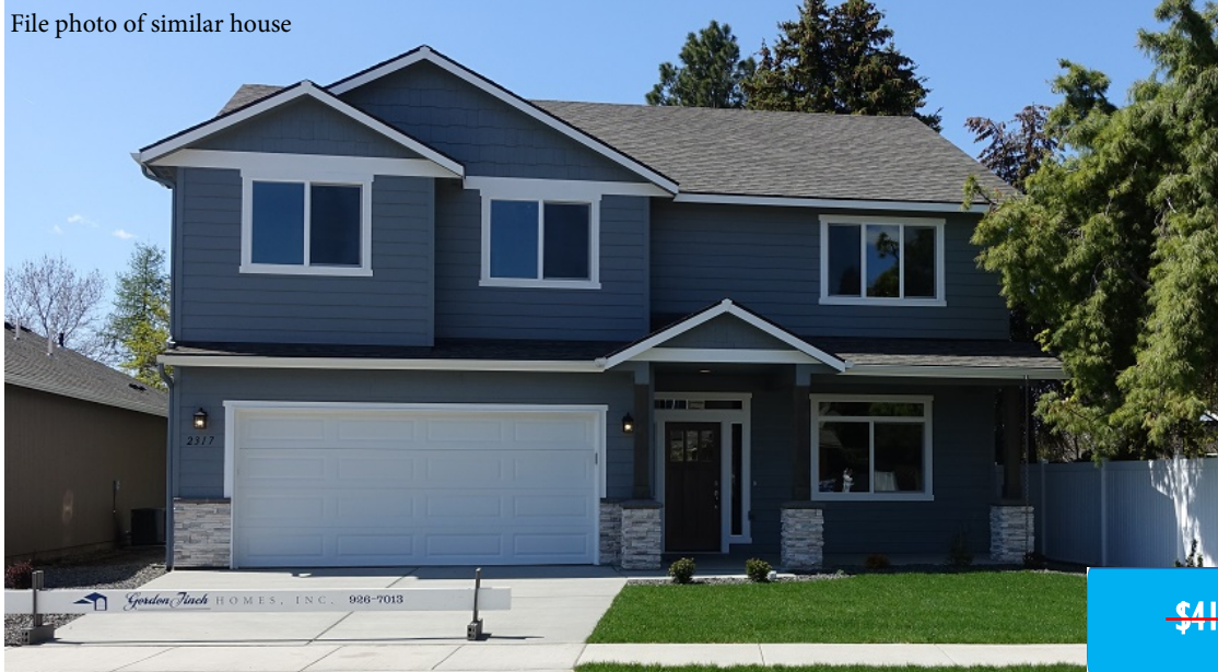
File photo of similar house