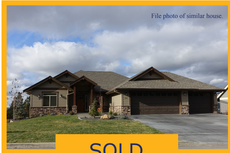
File photo of similar house.