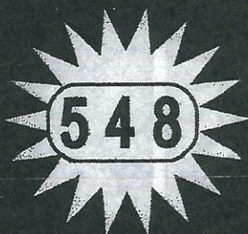
HOUSE MARKER 5" x 14"