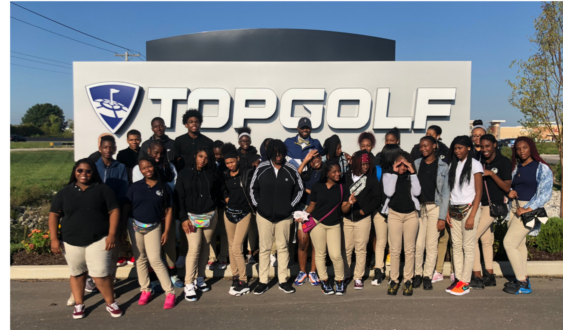
Students engaged in physical education class get to experience a field trip at Top Golf