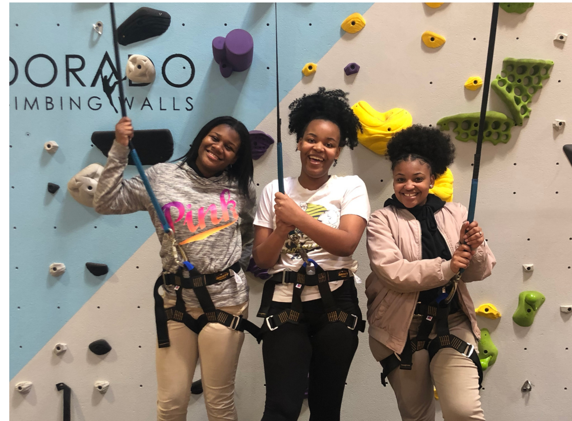
Students experience rock climbing for the first time in partnership with the leaders of Boys and Girls Club of Greater St. Louis