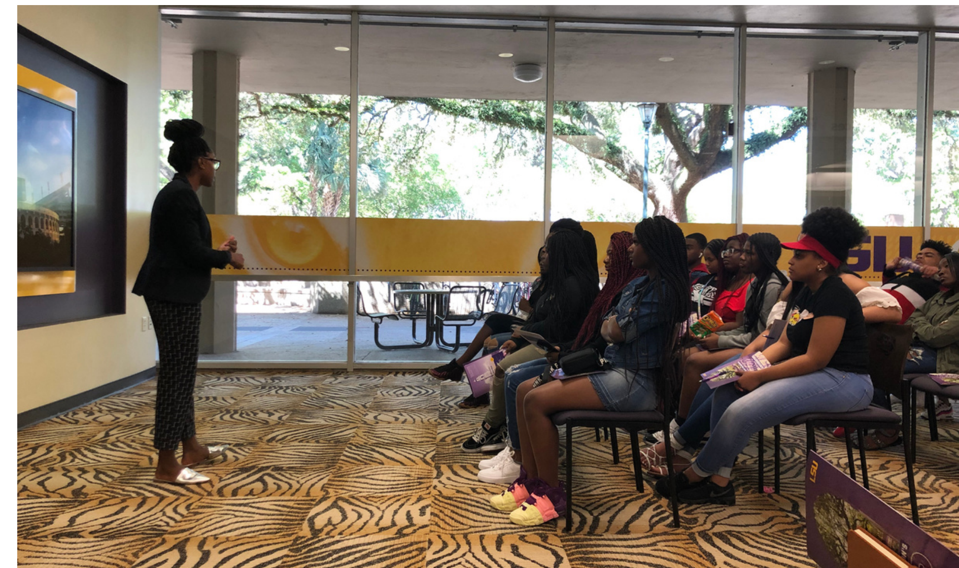
Students visit LSU campus for a biannual college tour