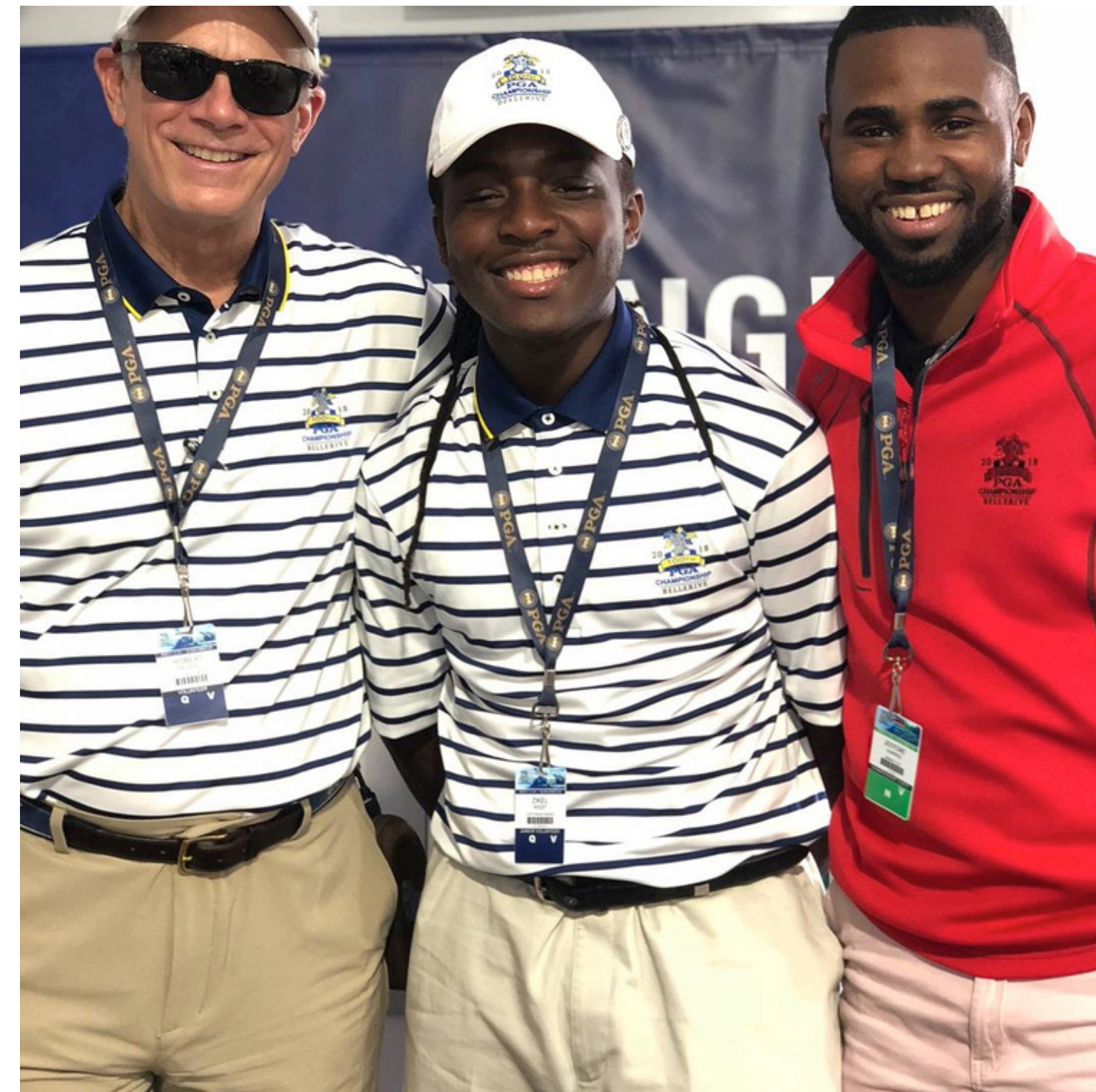
Student preparing to go out for a Tee time at the 100th PGA Championship