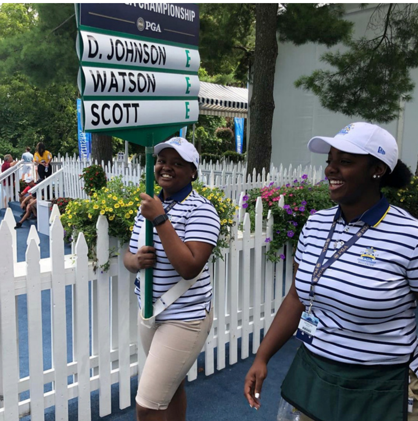
Students starting out for a tee time during the 100th PGA championship

Preparing youth in Urban St. Louis to be successful beyond high school, and expose them to the vast golf community.