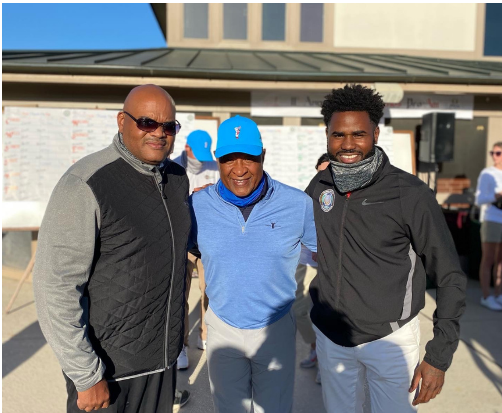
Fundraising Tournament for the Gateway PGA Reach Foundation