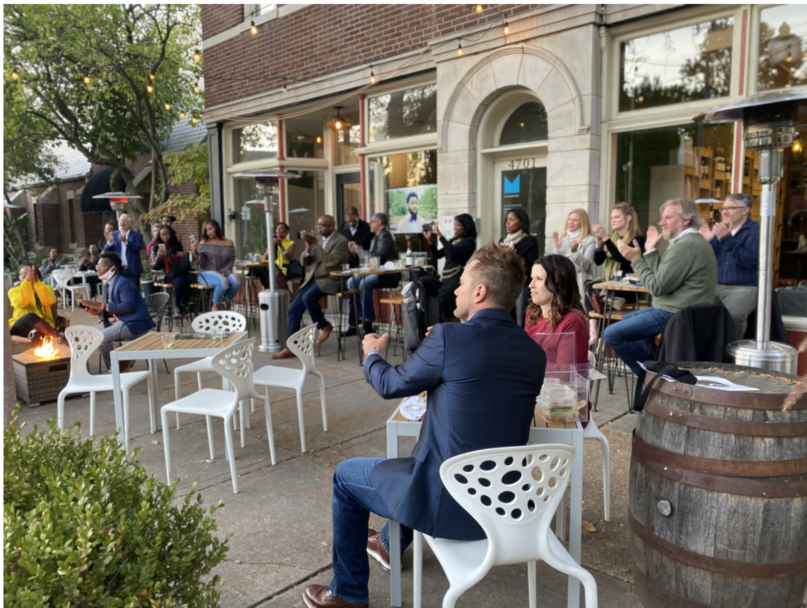
Urban Golf of Greater St. Louis' 1st fundraising event, Night of Fire