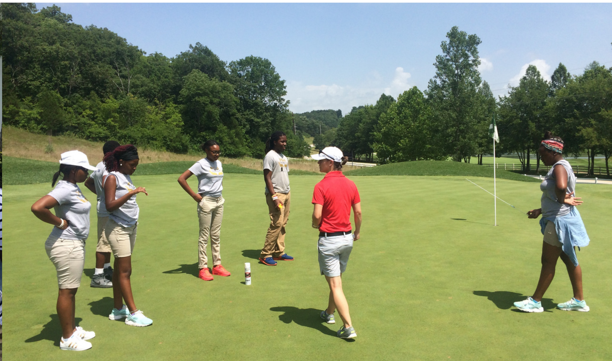
Students preparing the grounds of St. Albans Country Club for a Junior PGA Tournament