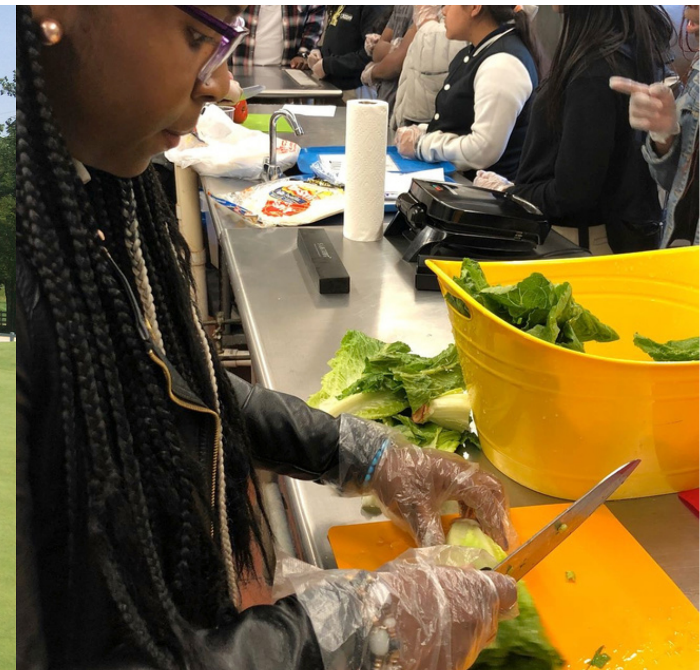
Students engaging in healthy meal prep in partnership with the St. Louis Science Center Y.E.S. Teens program.