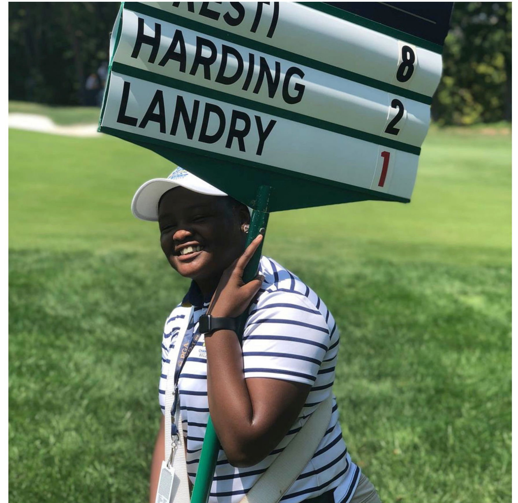
Student on course acting as a standard bearer for the 100th PGA Championship

Over $500,000 in student scholarships received