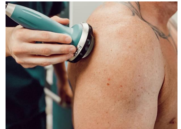
A Shockwave treatment being applied to the rotator cuf tendons and subacromial/subdeltoid bursa.

*Please refer to our general informational handout for descriptions of the modalities and therapeutic effects and goals common to treating musculoskeletal disorders.